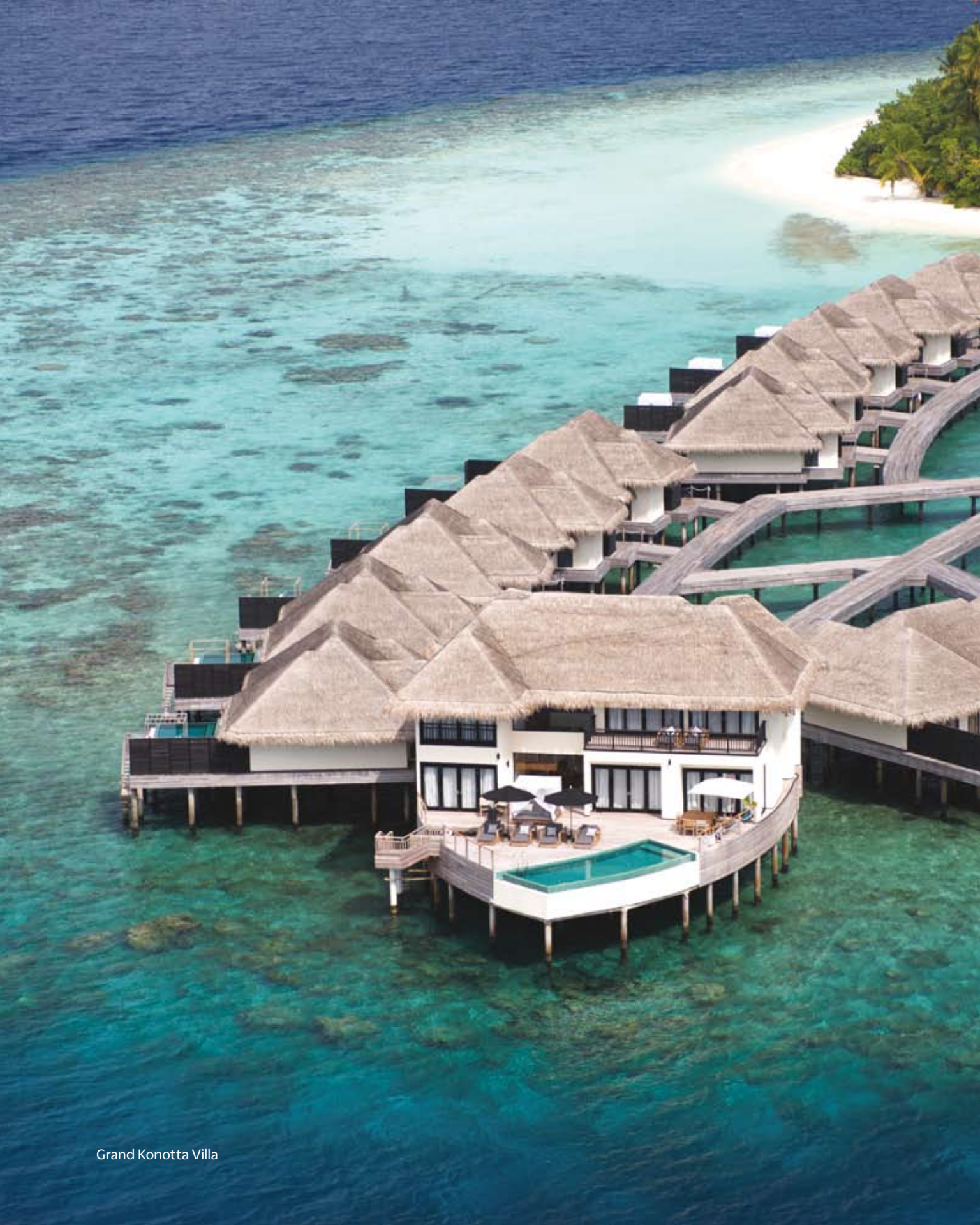
Grand Konotta Villa