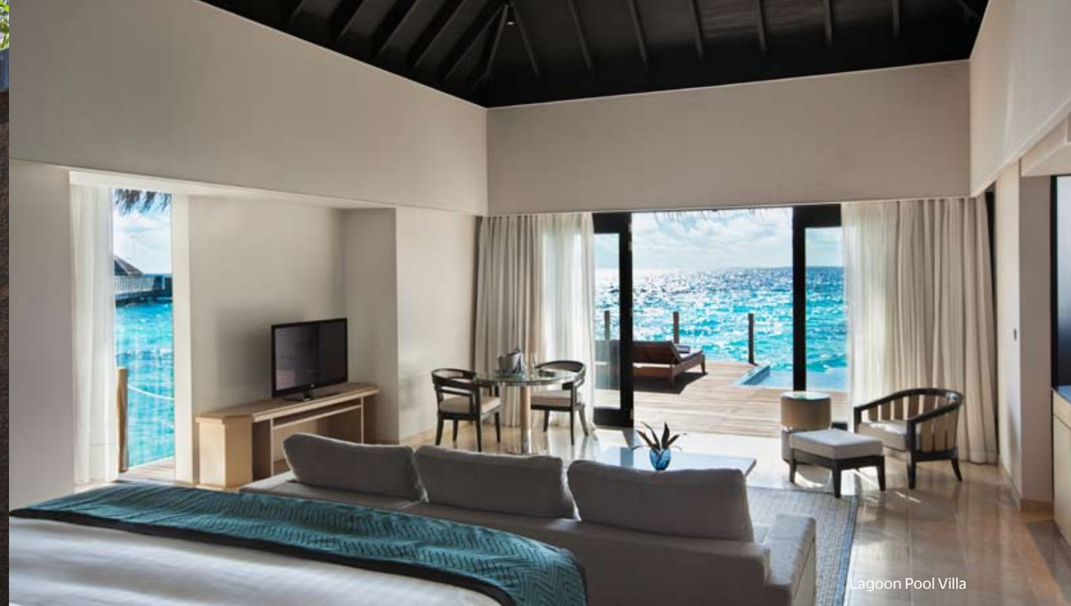
Lagoon Pool Villa