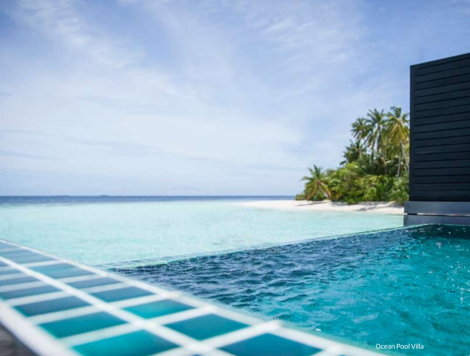
Ocean Pool Villa