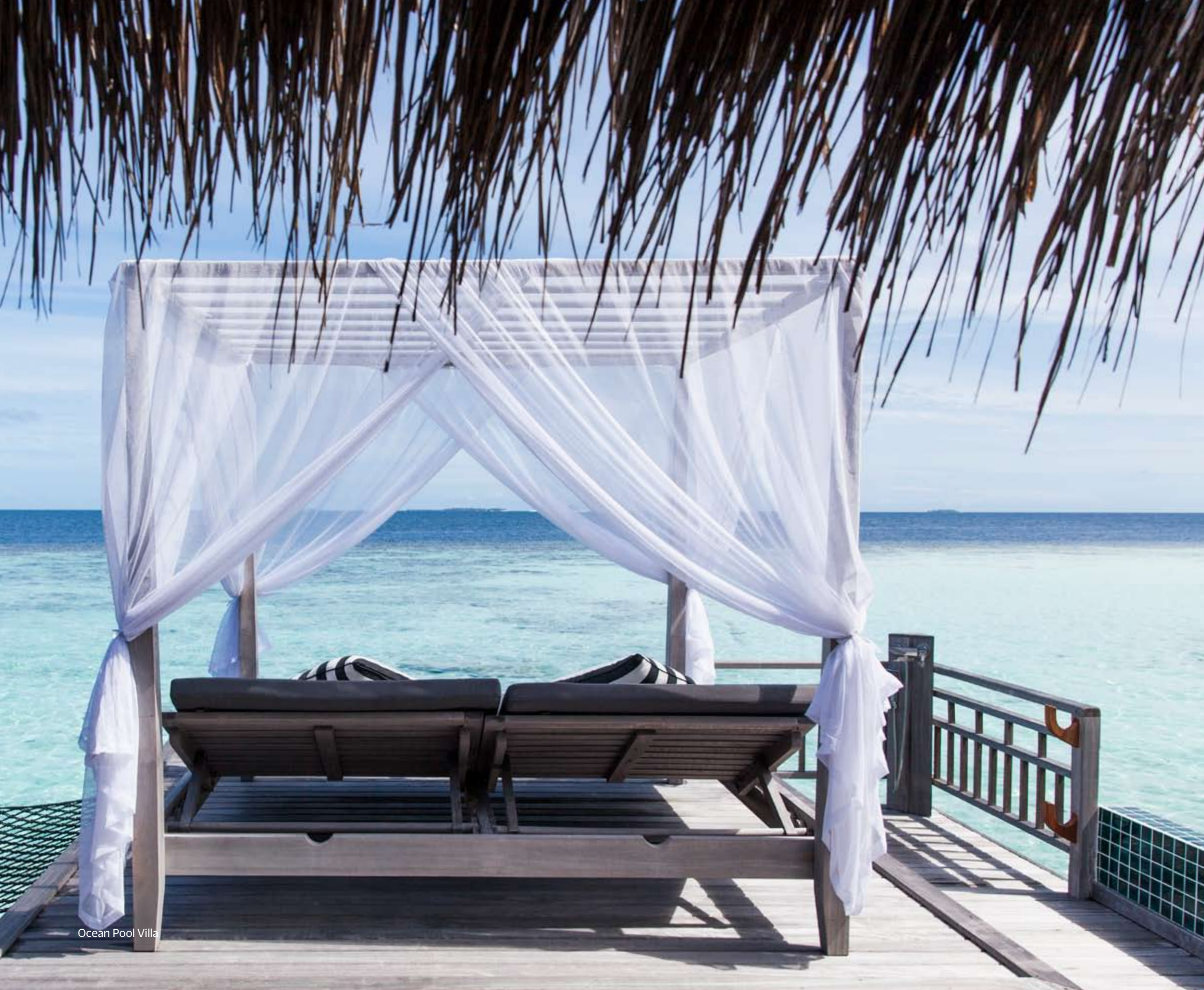
Ocean Pool Villa