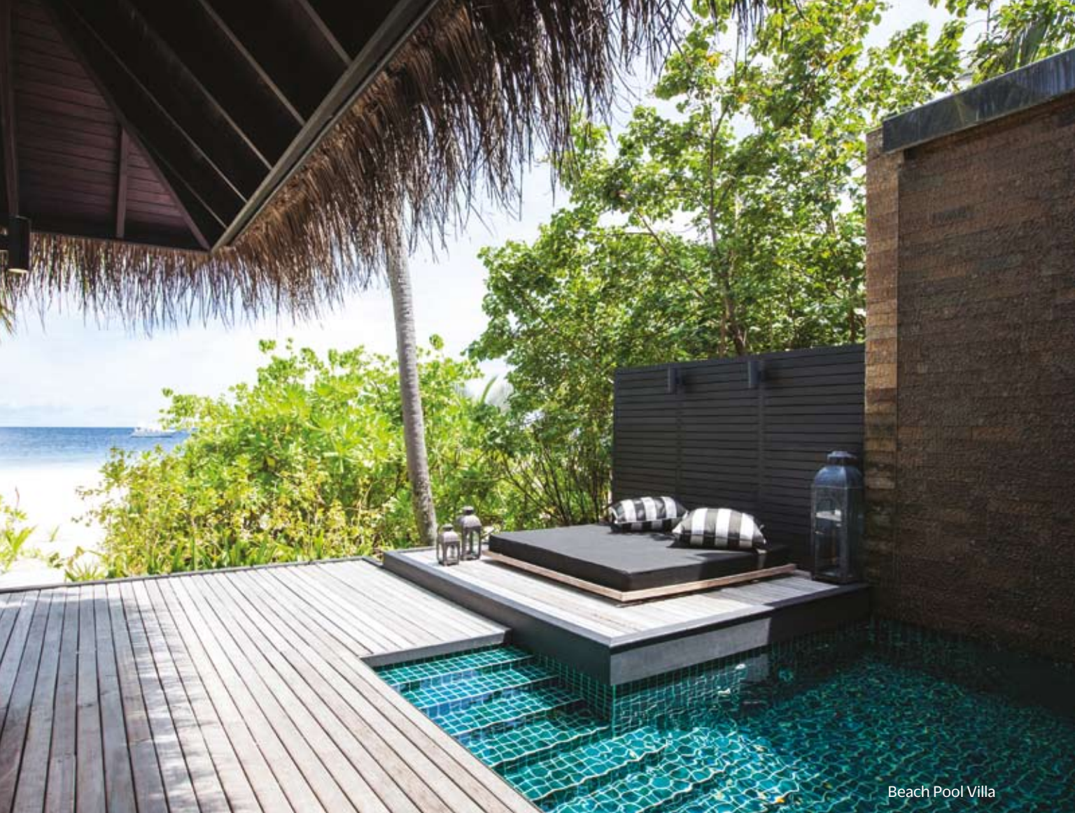
Beach Pool Villa