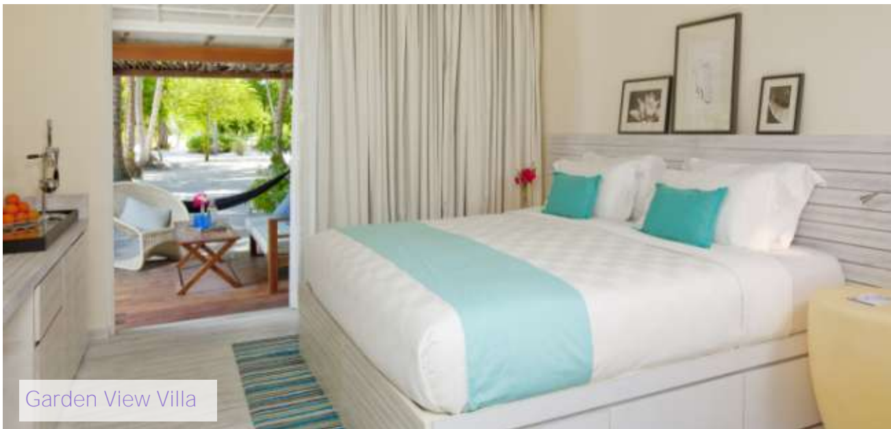
Garden View Villa