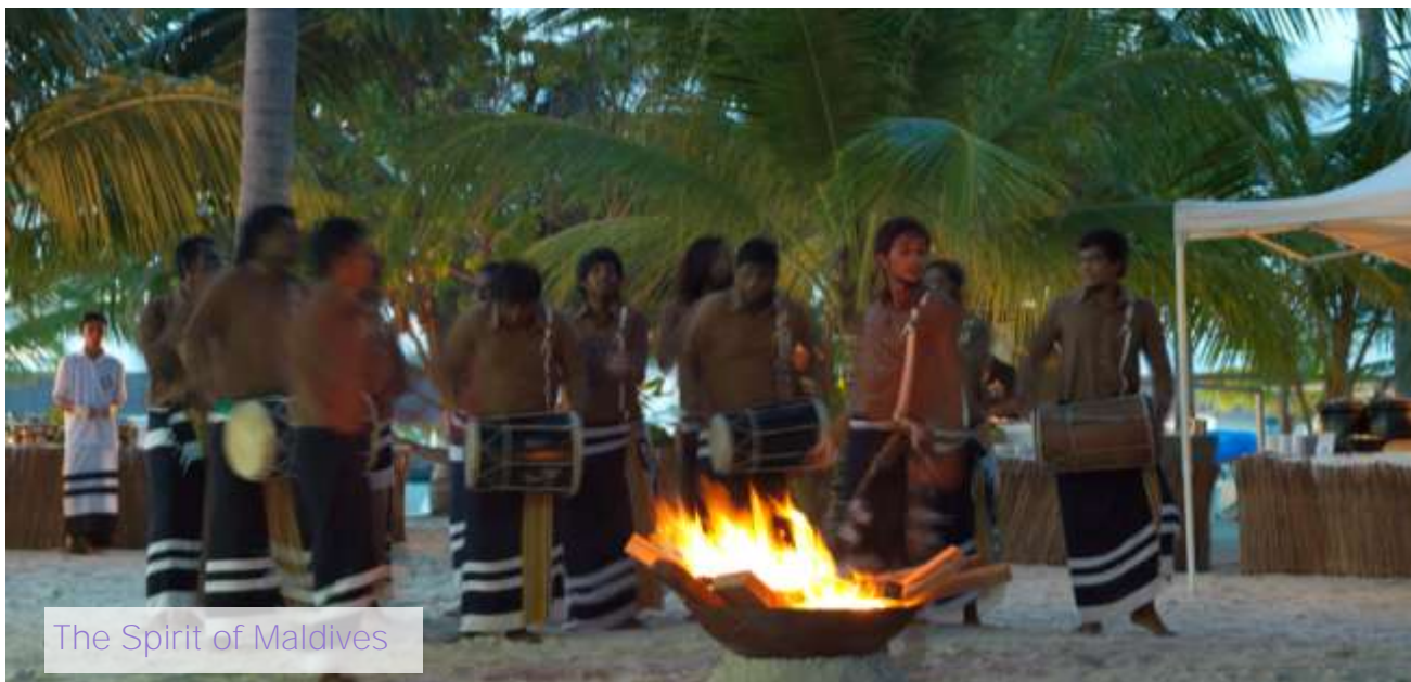
The Spirit of Maldives

Spirited 'Bodu Beru' Performance An integral part of Maldivian culture, 'Bodu Beru' is believed to have come with the Africans that settled in the Maldives in the early 19th century.