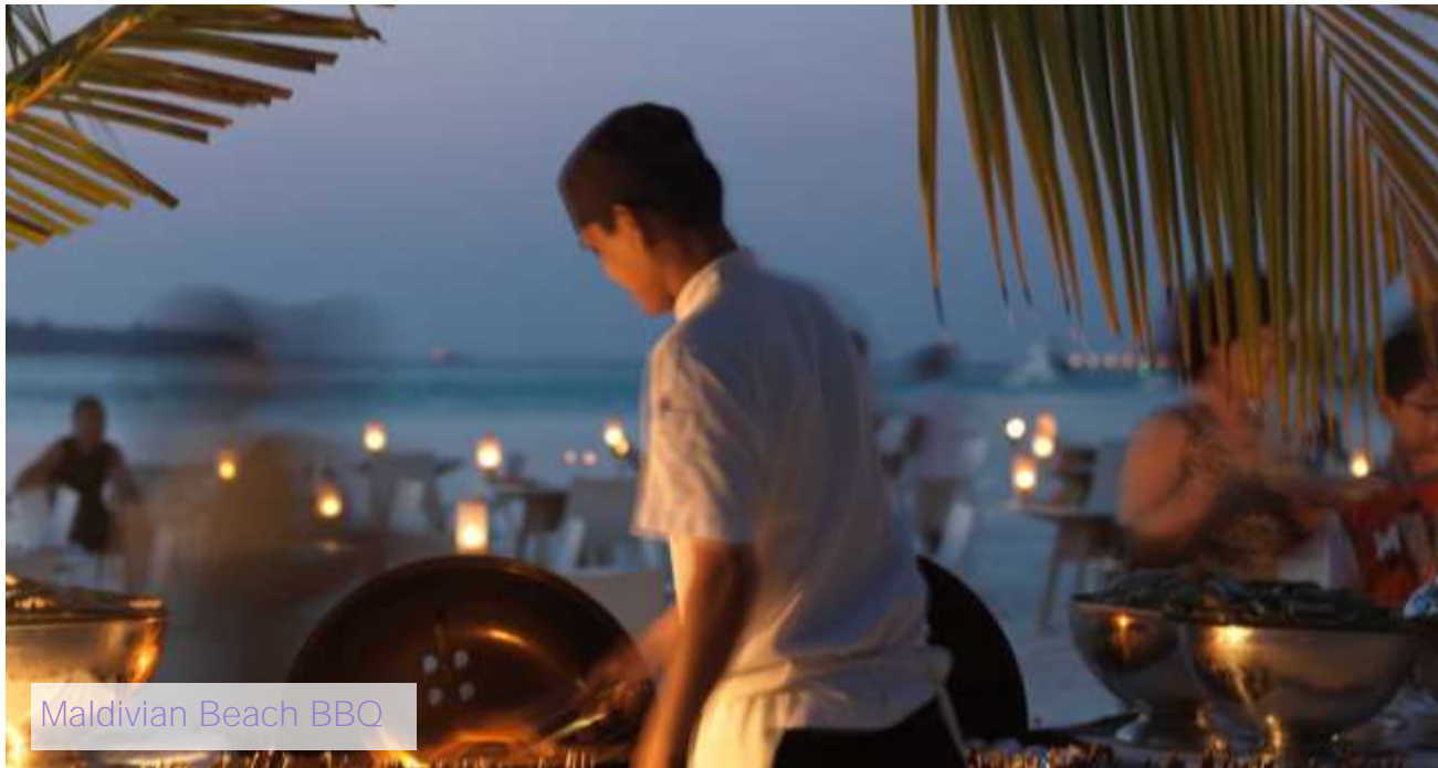
Maldivian Beach BBQ