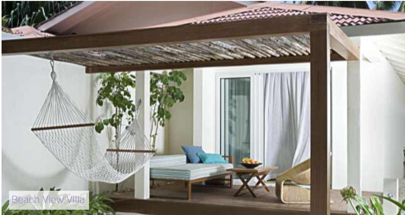
Beach View Villa