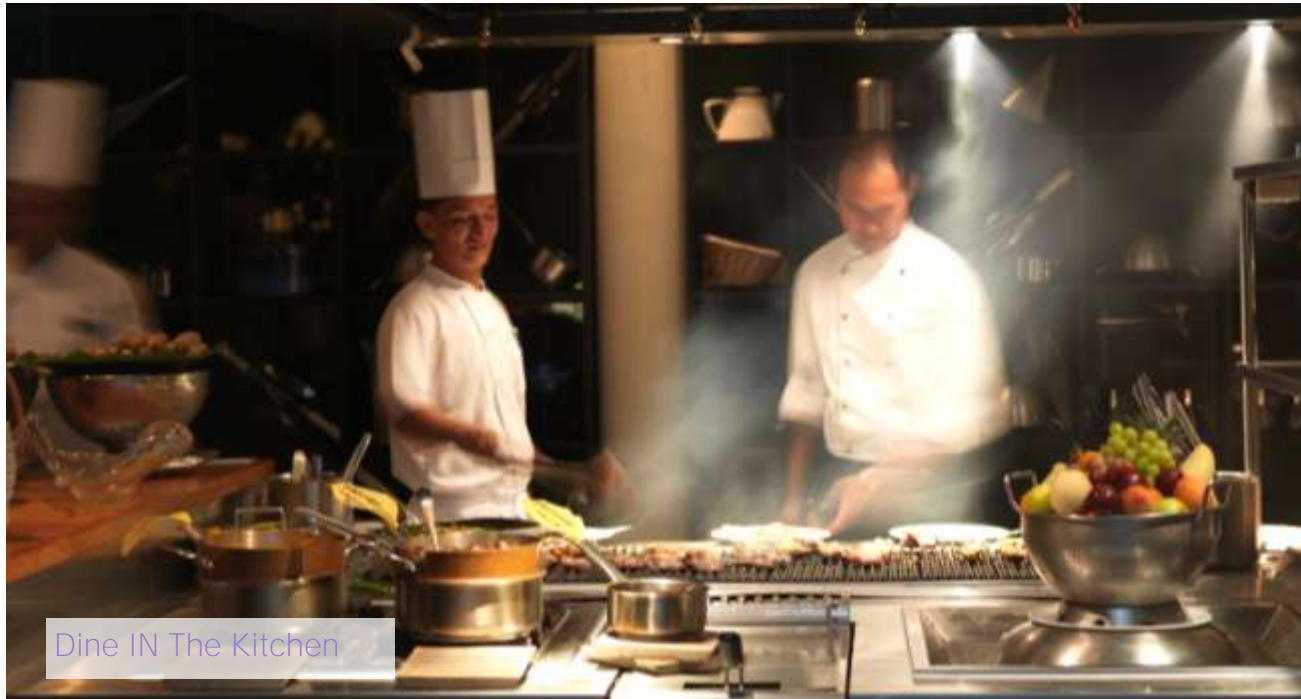
Dine IN The Kitchen